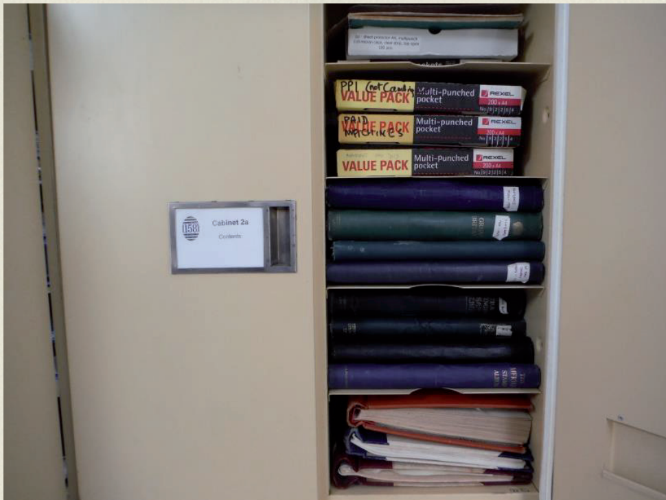
Fig. 6. Herbarium cabinet shelves. Unsorted albums and boxes.