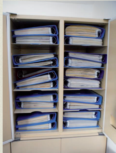
Fig. 5. Herbarium cabinet shelves. Typical A3 Album storage