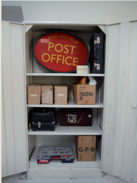
Fig. 4. Tall cupboard contents – large 3-D items