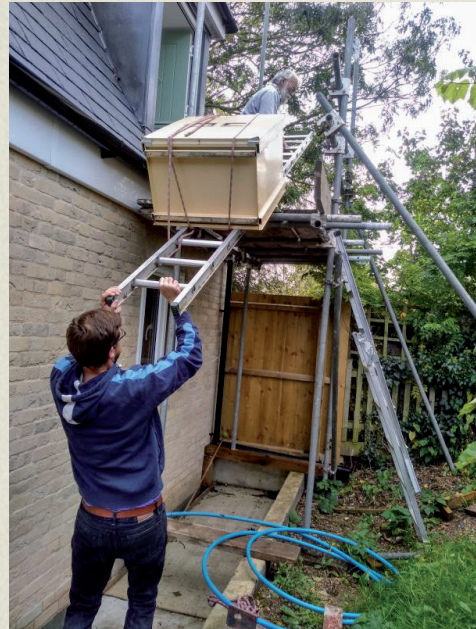
Figs 1, 2. Moving heavy cabinets up ladder.