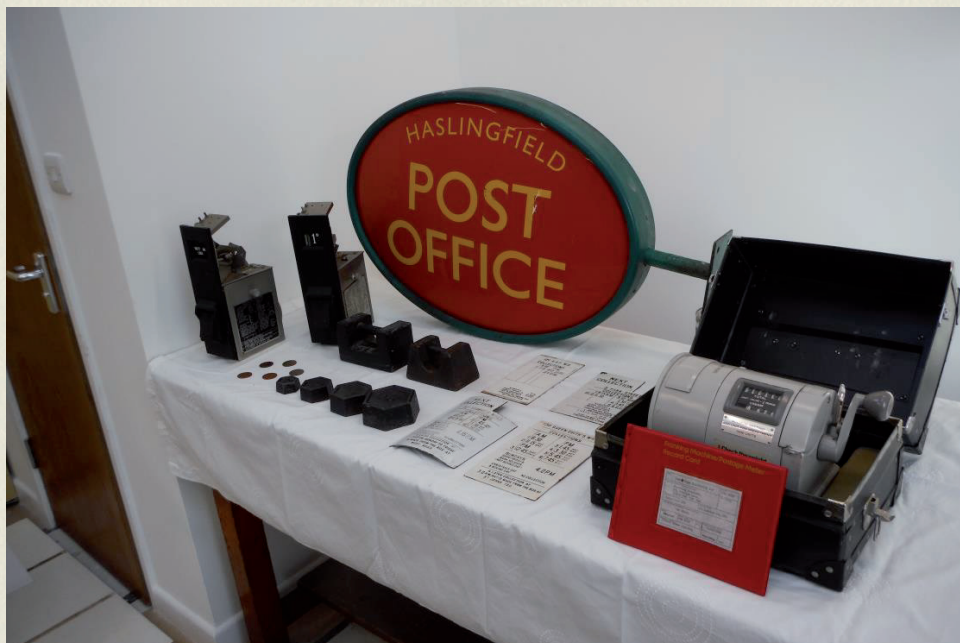
Fig. 8. Large items from the collection. PO stamp vending machines, weights, postbox plates and Pitney Bowes meter machine.