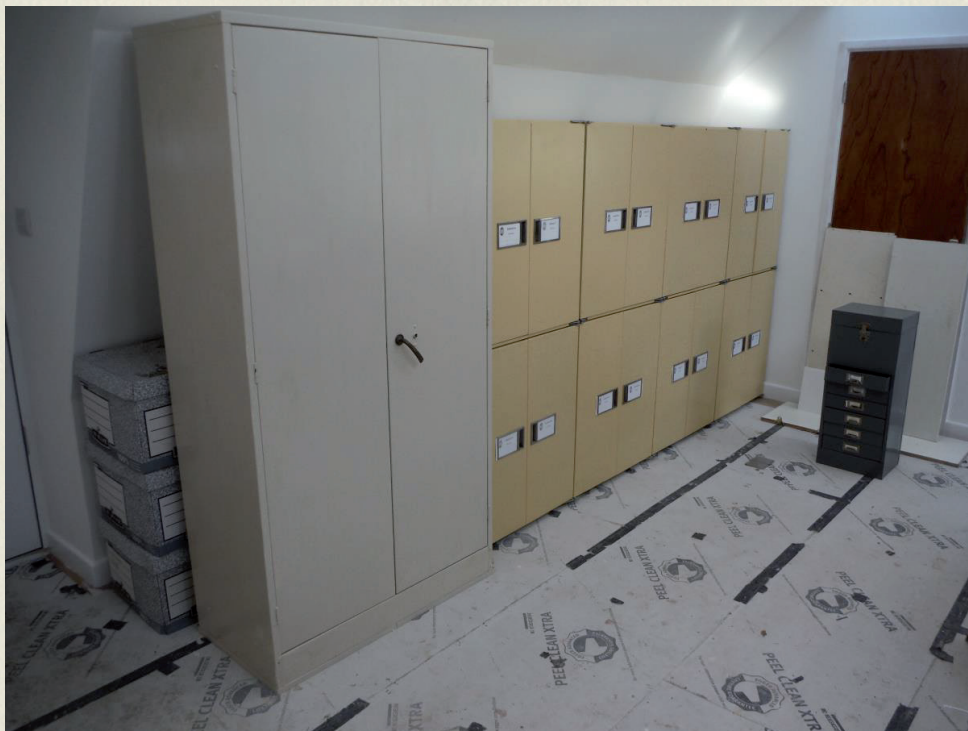
Fig. 3. Arranged steel cabinets in new location. L- R: Tall cupboard with shelves; herbarium cabinets (x8); grey cabinet with 6 drawers.