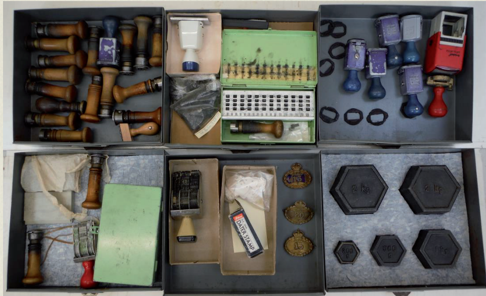
Fig. 7. Drawers from small cabinet